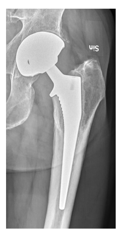
Figure 1. Radiograph of 4-year-old infection with coagulase negative staphylococci (CoNS) in uncemented THAs. Radiolucent lines are evident around the cup in Charnley zone 3 and around the stem in Gruen zones 1 and 7.

A PJI was considered eradicated when there were no inflammatory signs including normalized ESR and/or CRP or symptoms from the hip joint for a minimum of 2 years after termination of antibiotic treatment, which is considered the shortest time in published literature to establish infection eradication (Sendi et al., 2017). Unrelated death (n = 2) or hip revisions for other reasons than infection with negative perioperative cultures (n = 3) occurring during followup within 2 years were labeled eradicated. Final failure was defined as an ongoing PJI with no planned future surgery but suppressive life-long antibiotic treatment. Girdlestone resection arthroplasties were reported separately since they were successful regarding infection eradication, but not from a prosthetic point of view.